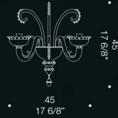
7092 A2 2xMAX 46W E14