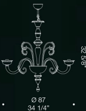
7092 K8 8xMAX 46W E14