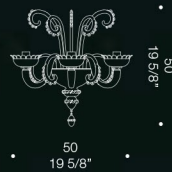
7092 A3 3xMAX 46W E14