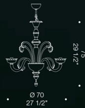
7092 K6 6xMAX 46W E14