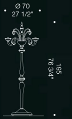
7092 R6 6xMAX 46W E14

7092 is a beautifully handcrafted and highly ornate chandelier made in Murano. Featuring beautiful gold leaf decorations, this traditional style chandelier is highly sought after for its distinct elegant look. Decorating the most luxurious homes and hotels around the globe, this piece comes in several different configurations, in order for a designer to create a cohesive, timeless interior. Highly customisable.